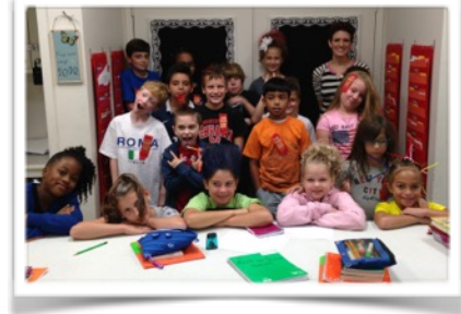
Grades 3-8 Social Studies at CTL

The book The Squiggle by Carole Lexa Schaefer and illustrator Pierr Morgan served as the CTL students' art inspiration for the week in the K-2 class. This book allows students to "visualize" how artists incorporate the element of lines in their art. Students explored using various types of lines (i.e. curly, zig zag, straight, dotted,